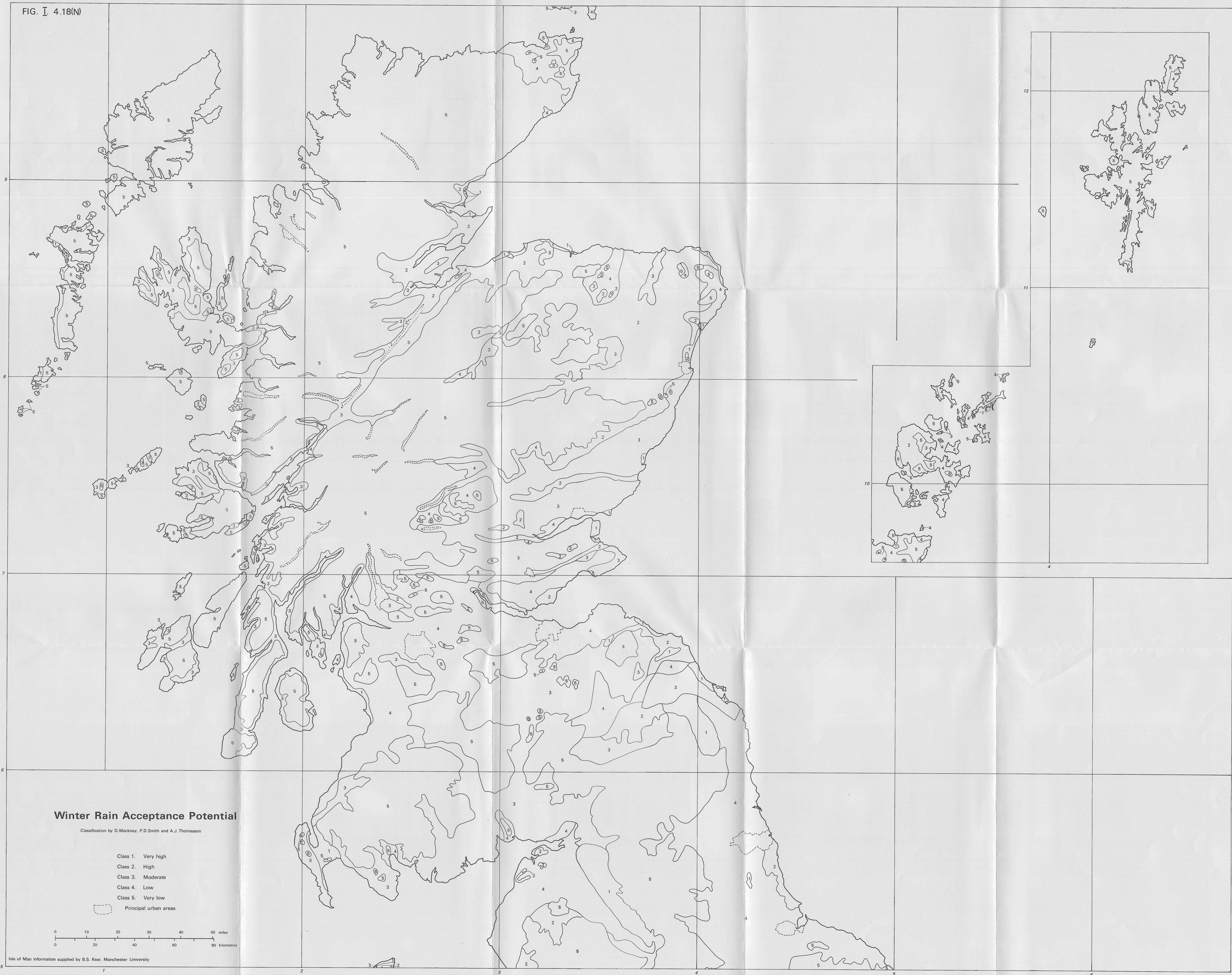
FIG. I. 4.18(N)